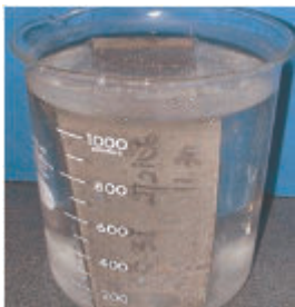
After 1500 hours Mild steel immersed in sea water with 0.05% of Vapro 844