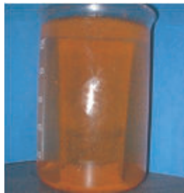
After 1500 hours Mild steel immersed in sea water without Vapro 844