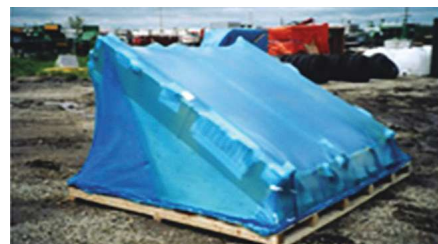
FIGURE 2 Wrapped military hardware on a wood pallet ready for moving.