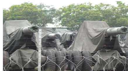
FIGURE 1 Heavy cannons on wheels covered with rough canvas fabric impregnated with a VCI.

The most commonly used vehicle is the high mobility multipurpose wheeled vehicle, also known as the Humvee, particularly in the deserts of the Middle East. The complex interaction of chemical and climatic factors, such as hot afternoons and cold nights, with dew condensation, intense