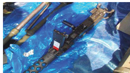
FIGURE 3 Weapon parts wrapped with transparent plastic sheets containing a VCI.

solar radiation, and salt-laden atmosphere as well as saline, brackish, and briny water, create a harsh corrosive environment. The military vehicles are damaged by corrosion, erosion, abrasion, and wear that impair vehicle mobility and long service life, requiring costly, ongoing maintenance. Plastics, elastomers, and composites are generally unsuitable alternatives because they deteriorate by physicochemical mechanisms.